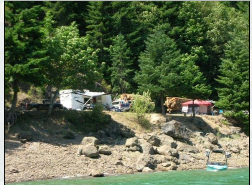
Quartzville Corridor at Green Peter Lake